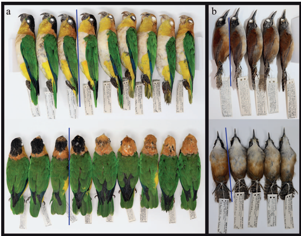
Figure 2. Specimens of 2 species pairs bounded by the Ucayali River show evidence of introgression across the river. In each panel, a blue line indicates the divide between west/left bank birds from Tournavista and east/right bank birds from Preferida, which is located within the patch of terra firme forest that was transported from the west bank to the east bank during the Ucayali avulsion. (a) Pionites parrots: Black-headed Parrot ( P. melanocephalus ) is expected on the west bank and White-bellied Parrot ( P. leucogaster ) on the east bank. The 3 west bank individuals (left to right: LSUMZ 228716, 228718, 228713) show largely P. melanocephalus phenotypes but with varying degrees of leucogaster -like traits: LSUMZ 228716 appears close to the parental type, but the other 2 show orange feathering in the forehead and crown and the amount of green in the lores is reduced, especially in LSUMZ 228713. Six individuals from the east bank at Preferida are shown (left to right: LSUMZ 228725, 228726, 228720, 228727, 228729, 228730). One east bank individual, LSUMZ 228725 (fourth from left overall), shows a melanocephalus -like phenotype, despite being on the “wrong” side of the Ucayali River. Like P. melanocephalus it has a fully black crown, bill, and orbital skin, but unlike P. melanocephalus it has very little green in the lores. Among the other more leucogaster -like individuals, there is substantial variation in the presence of melanocephalus -like traits, such as black feathers in the crown, dark coloring of the bill and orbital skin, and green feathers in the lores. (b) Pheugopedius wrens: Coraya Wren ( P. coraya ) is expected on the west bank and Moustached Wren ( P. genibarbis ) on the east bank. The individual from the west bank (LSUMZ 228997) is typical for P. coraya , with dark throughout the auriculars, malar, and lateral throat stripe and rich chestnut coloration on the flanks and belly. The 4 individuals from Preferida on the east bank (left to right: LSUMZ 228994, 228992, 228996, 228988) show variation in their facial patterns, including in the degree of white streaking in the auriculars and the extent to which a white malar divides the auriculars from the dark lateral throat stripe. The color of the flanks also varies, but interestingly does not seem to correspond with the face pattern: the individual with the most coraya -like face pattern (LSUMZ 228994) has among the lightest and least extensive chestnut coloration on the underparts.

feathers, dark orbital skin, and dusky bill east of the Ucayali River and a Black-headed Parrot (AMNH 237774) with rusty orange on the forecrown whose date of collection (5 August